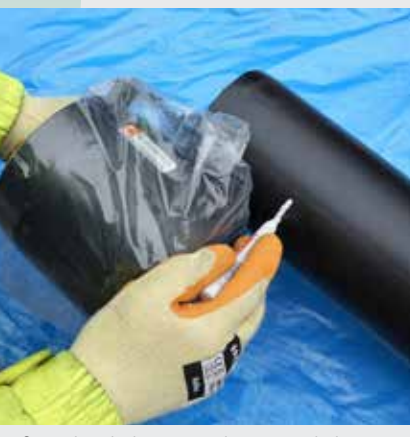
4. Cross hatch the area to be scraped plus an additional 20-50mm using the indelible marker pen.