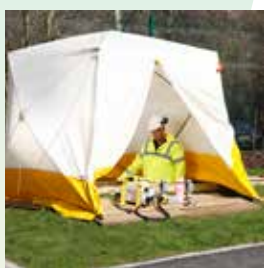
Welding tent/shelter and ground sheet