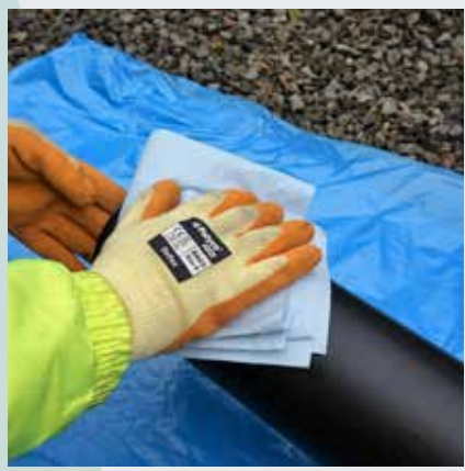
3. Mark the insertion depth on the pipe by holding the bagged fitting against the pipe.