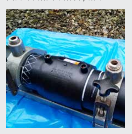
N.B. Spigot fittings i.e. saddle outlets, spigot outlet on tees, stub flanges should be scraped and restrained as with pipes.

Important Note: It is imperative that both the pipe and fitting jointing surfaces are kept clean and dry during the assembly and welding process. This is best achieved by preparing the pipe and then immediately assembling.