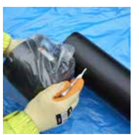
Indelible marker pen