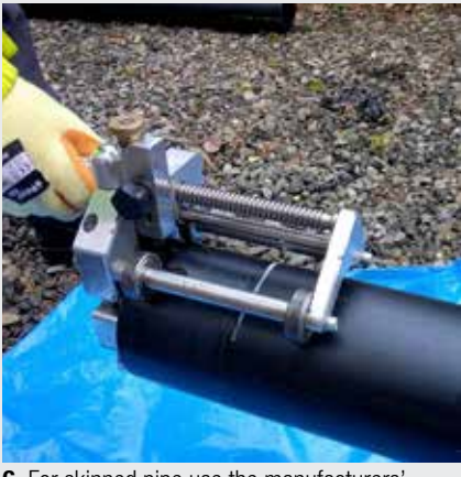
6. For skinned pipe use the manufacturers' recommended tools to remove the skin. Some skinned pipe still requires a scraping operation but seek advice from the pipe manufacturer before preparing to join the pipe.

5. Scrape one pipe end using a prescribed tool, for the length of the insertion depth plus 10-20mm. Ensure the whole surface area has been scraped.