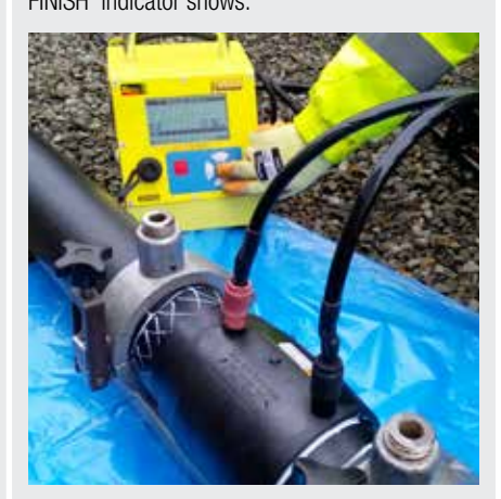
5. Allow weld to cool for the full time stated on fitting before removing clamps and moving the assembly.