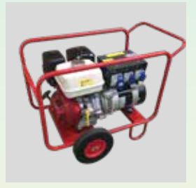
Generator of suitable size to power control box - refer to manufacturers' literature for power requirements