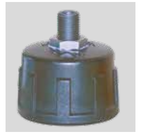
Multiseal test cap